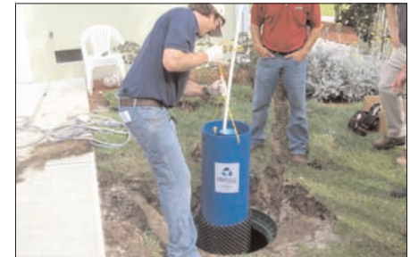
Typical Remediator Installation