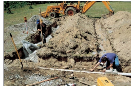
Typical Septic System Replacement Installation