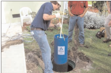
Typical Remediator Installation