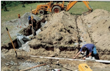
Typical Septic System Replacement Installation