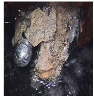
A picture is worth a 1000 words. Solid chunks of grease & soap in a local school's main line. The entire line was almost closed off. The students did not like that we were able to clean the line and keep the school open.

may be having problems. We provide service to most of the local Fire Stations, Channahon, Minooka, Braidwood, Nettle Creek & Gardner Schools, as well as Lyondel, Aux Sable, Stepan Chemicals, Akzo Nobel factories just to name a few.