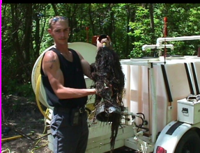
Tree Roots cleaned from a 15" line.